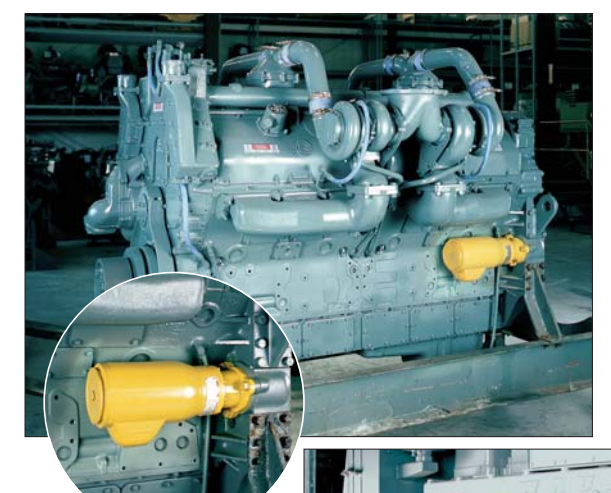
An ST650BP03R31 starter is shown mounted on a Detroit Diesel 12V-149R engine.