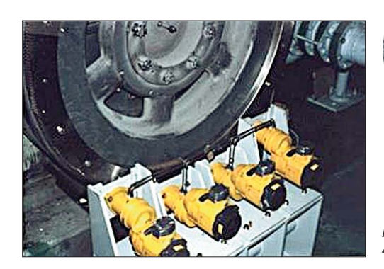
Multiple starter application: 4 x ST900